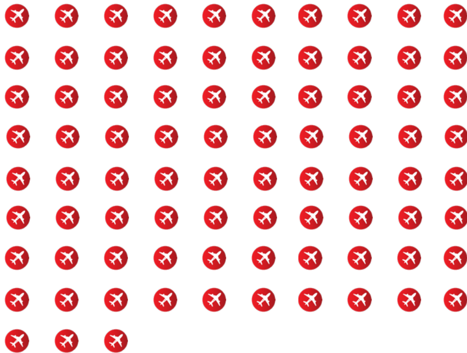
Part 135 Operators